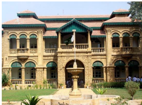
QAID E AZAM MUSUEM